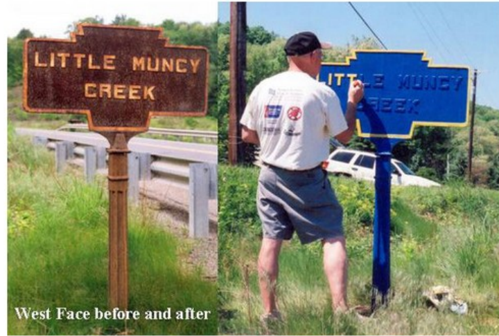
West Face before and after

Have you seen an old, faded, rusted sign marking a river crossing in your town? Keystone Marker Trust wants to hear from you!